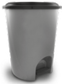
008042 Basurero con pedal Trash Bin with step

Contenido/Content: 20000 mL / 676 Onz Master Pack: ? CBM: ? Peso/Weight: ? kg Dimensiones/ Size: ? Colores/Colours: