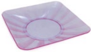
V002-5A Platón Cuadrado Hondo Deep Square Tray

Master Pack: 180 CBM: 0.0471 Peso/Weight: 16.84 kg Dimensiones/ Size: 22.7 x 3 x 22.7 cm Colores/Colours: ○ ● ● ● ● ● ● ● ●