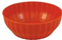
PT-0086 Ensaladera Salad Bowl

Contenido/Content: 1500 mL / 50.5 Onz Master Pack: 180 CBM: 0.1545 Peso/Weight: 17.40 kg Dimensiones/ Size: 20 x 7 cm ø 20 cm Colores/Colours: ○ ● ● ● ● ● ● ● ●