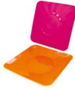
V002-4B Platón Cuadrado Square Tray

Master Pack: 170 CBM: 0.0186 Peso/Weight: 10.20 kg Dimensiones/ Size: 17.8 x 1.5 x 17.8 cm Colores/Colours: ○ ● ● ● ● ● ● ● ●