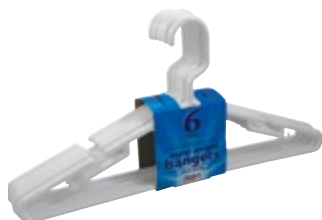
009012 Percha No.4 Hangers No.4