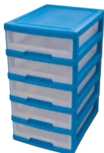
011055 Gavetero mediano Medium drawers