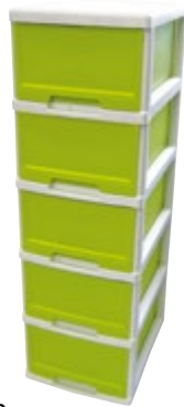
011019 Gavetero grande Large drawers