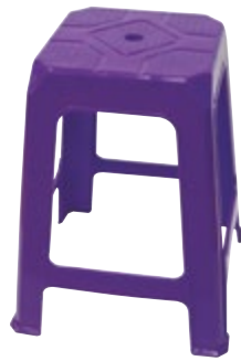
011042 Banco Plástico Plastic Bench

Master Pack: 15 CBM: 0.112752 Peso/Weight: 9.55 kg Dimensiones/ Size: 37 x 45 x 37 cm