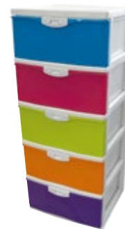
011039-5 Gavetero PLUS PLUS drawers