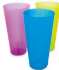
004061 Vaso Jumbo Jumbo Tumbler

Contenido/Content: 350 mL / 12 Onz Master Pack: 96 CBM: 0.0471 Peso/Weight: 11.10 kg Dimensiones/ Size: 7.8 x 11 cm ø 7.8 cm Colores/Colours: ○ ● ● ● ● ●