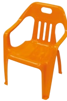
011059 Silla para Niños Child's Chair

Master Pack: 15 CBM: 0.0738 Peso/Weight: 9.10 kg Dimensiones/ Size: 38.5 x 50 x 30 cm