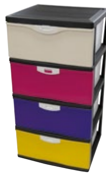
011041-4 Gavetero PLUS PLUS drawers