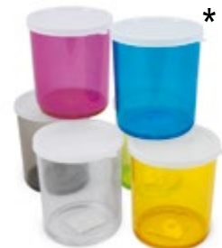
004007 Vaso Despensa c/ tapa Storage Tumbler w/ lid