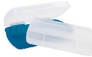
12007 Cartuchera Grande Pencil Case Large

Master Pack: 48 CBM: 0.0471 Peso/Weight: 5.20 kg Dimensiones/ Size: 22 x 5 x 9 cm Colores/Colours: