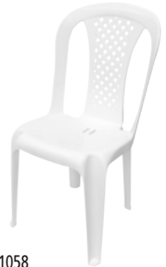
011058 Silla Chair

Master Pack: 1 CBM: 0.0151 Peso/Weight: 1.85 kg Dimensiones/ Size: 42 x 88 x 40 cm