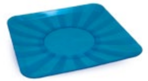
V002-4A Platón Cuadrado Square Tray

Master Pack: 240 CBM: 0.0471 Peso/Weight: 22,20 kg Dimensiones/ Size: 24.6 x 2 x 24.6 cm Colores/Colours: ○ ● ● ● ● ● ● ● ●