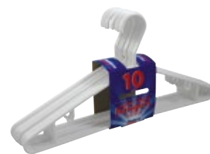
009007 Percha No.14 Hangers No.14