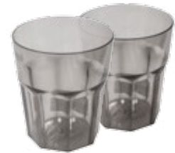
004063 Vaso Whiskero Whisky Glass