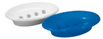
011024 Jabonera Individual Oval

Master Pack: 264 CBM: 0.1103 Peso/Weight: 10.00 kg Dimensiones/ Size: 11 x 4.5 x 8 cm Colores/Colours: ○ ● ● ● ● ●