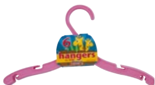
009025 Percha Niño Gde. Cloth hangers