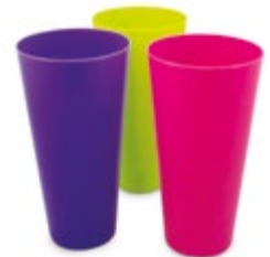
004062 Vaso Jumbo Jumbo Tumbler

Contenido/Content: 940 mL / 32 Onz Master Pack: 144 CBM: 0.0648 Peso/Weight: 11.65 kg Dimensiones/ Size: 9.8 x 19.1 cm ø 9.8 cm Colores/Colours: ○ ● ● ● ● ●