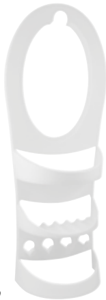
011022 Organizador para baño PLUS Bathroom Organizers PLUS

Master Pack: 48 CBM: 0.0930 Peso/Weight: 6.15 kg Dimensiones/ Size: 14 x 11 x 14 cm Colores/Colours: ○ ● ● ● ● ●