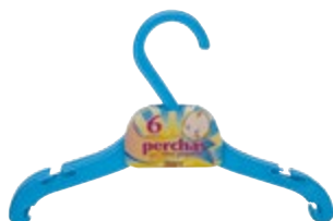
009026 Percha Niño Peq. Cloth hangers