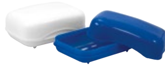
011003 Jabonera Individual Soap Case

Master Pack: ? CBM: ? Peso/Weight: ? kg Dimensiones/ Size: ? Colores/Colours: ○ ● ● ● ● ●