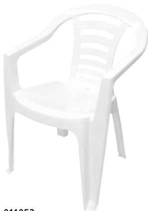
011053 Silla con Reposabrazo Chair with Armrest

Master Pack: 1 CBM: 0.0187 Peso/Weight: 1.85 kg Dimensiones/ Size: 58 x 77 x 55 cm