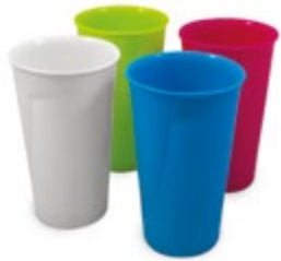
004005 Vaso Twist Twist Tumbler

Contenido/Content: 530 mL / 18 Onz Master Pack: 198 CBM: 0.0648 Peso/Weight: 13.75 kg Dimensiones/ Size: 8.8 x 14.7 cm ø 8.8 cm Colores/Colours: ○ ● ● ● ● ●