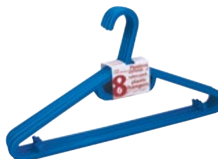
009032 Percha No.15 Hangers No.15