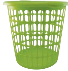
011034 Canasta para Ropa Laundry hamper

Contenido/Content: 45000 mL / 1521.5 Onz