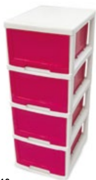
011018 Gavetero grande Large drawers