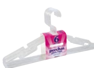
009018 Percha No.4 Hangers No.4