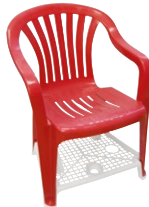
MIT-001 Silla DELUXE + Base DELUXE Chair + Base

Master Pack: 1 CBM: 0.0182 Peso/Weight: 2.60 kg Dimensiones/ Size: 59 x 81 x 44 cm