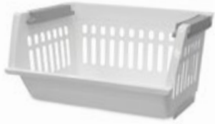
011040-1B Canasta Apilable Stacking Container