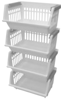
011040-4 Canasta Apilable Stacking Container