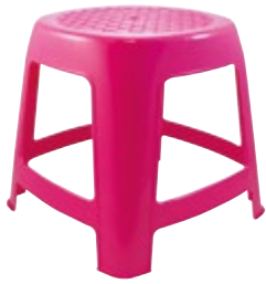
011054 Banco Plástico Mini Plastic Bench Mini

Master Pack: 18 CBM: 0.0510 Peso/Weight: 6.75 kg Dimensiones/ Size: 29 x 26 cm ø 29 cm