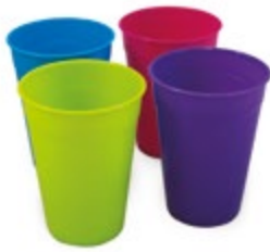
004003 Vaso Olas Olas Tumbler