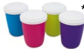
004046 Vaso Dorr 69 c/ tapa Dorr 69 Tumbler w/ lid