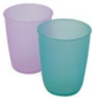
004012 Vaso Dorr 69 Dorr Tumbler 69