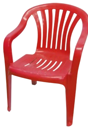
MIT-002 Silla DELUXE DELUXE Chair

Master Pack: 1 CBM: 0.0182 Peso/Weight: 2.60 kg Dimensiones/ Size: 53 x 79.5 x 44 cm