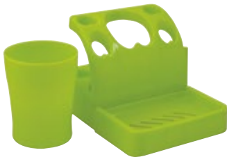
011038 Organizador Cepillo + Jabonera + Vaso Toothbrush Holder + Soap Case + Cup Organizer

Oval Soap Case Master Pack: 180 CBM: 0.1103 Peso/Weight: 9.26 kg Dimensiones/ Size: 16 x 3.5 x 12 cm Colores/Colours: ○ ● ● ● ● ●