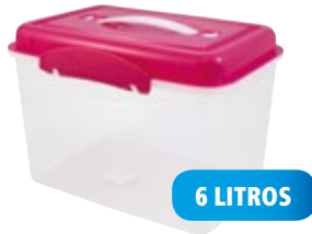
011036 Caja Rectangular Rectangular Box

Contenido/Content: 6 L / 202.8 Onz Master Pack: 50 CBM: 0.1545 Peso/Weight: 15.60 kg Dimensiones/ Size: 26 x 18.5 x 19,5 cm Colores/Colours: