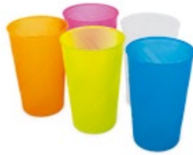
004010 Vaso Neo Neo Tumbler

Contenido/Content: 530 mL / 18 Onz Master Pack: 198 CBM: 0.0648 Peso/Weight: 13.75 kg Dimensiones/ Size: 8.8 x 14.7 cm ø 8.8 cm Colores/Colours: ○ ● ● ● ● ●