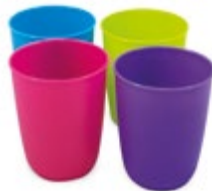
004013 Vaso Dorr 69 Dorr Tumbler 69