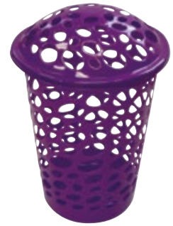
011052 Canasta para Ropa con tapa Laundry hamper with lid