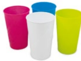
004011 Vaso Neo Neo Tumbler

Contenido/Content: 380 mL / 13 Onz Master Pack: 288 CBM: 0.0471 Peso/Weight: 7.40 kg Dimensiones/ Size: 7.8 x 12.2 cm ø 7.8 cm Colores/Colours: ○ ● ● ● ● ●