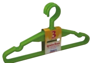
009004 Percha cabeza móvil Swivel Hook Hangers