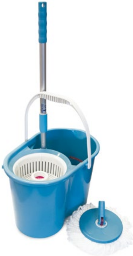
CA-525 Mummy Mop