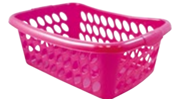
011051 Canasta para Ropa Laundry hamper