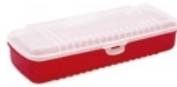
12006 Cartuchera Pequeña Pencil Case Small

Contenido/Content: 6 L / 202.8 Onz Master Pack: 50 CBM: 0.1545 Peso/Weight: 15.60 kg Dimensiones/ Size: 26 x 18.5 x 19,5 cm Colores/Colours: