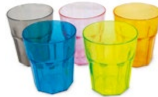
004055 Vaso Whiskero Whisky Glass