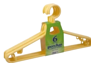
009022 Percha No.9 corbatas Hanger No.9 for ties