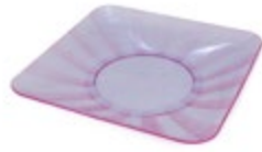
V002-8A Platón Cuadrado Hondo Deep Square Tray

Master Pack: 180 CBM: 0.0471 Peso/Weight: 16.84 kg Dimensiones/ Size: 22.7 x 3 x 22.7 cm Colores/Colours: ○ ● ● ● ● ● ● ● ●