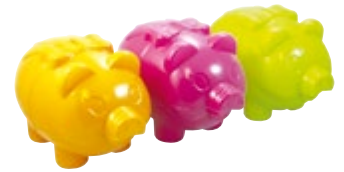
012009 Piggy Alcancía Piggy moneybox

Master Pack: 50 CBM: 0.0930 Peso/Weight: 12.40 kg Dimensiones/ Size: 23 x 6 x 14 cm Colores/Colours: