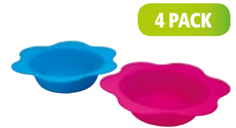
008041-S4 Taza Flor/ Flower Bowl

Contenido/Content: 500 mL / 17 Onz Master Pack: 72 CBM: 0.1131 Peso/Weight: 9.60 kg Dimensiones/ Size: 20 x 5 cm ø 20 cm Colores/Colours: ○ ● ● ● ● ● ● ● ●