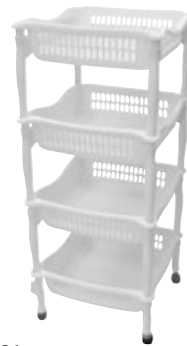
011031 Estante Multipropósito Cuadrado

Rectangular Multipurpose Rack Master Pack: 5 CBM: 0.1053 Peso/Weight: 9.10 kg Dimensiones/ Size: 46 x 86.5 x 32 cm Colores/Colours: