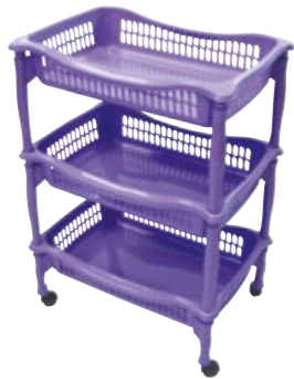
011029 Estante Multipropósito Rectangular

Master Pack: 50 CBM: 0.1935 Peso/Weight: 5.55 kg Dimensiones/ Size: 20 x 13.5 x 12 cm Colores/Colours: