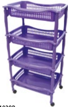
011028B Estante Multipropósito Rectangular

Rectangular Multipurpose Rack Master Pack: 6 CBM: 0.1103 Peso/Weight: 9.05 kg Dimensiones/ Size: 46 x 64 x 32 cm Colores/Colours: