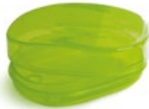
? Jabonera Individual Soap Case

Contenido/Content: 20000 mL / 676 Onz Master Pack: ? CBM: ? Peso/Weight: ? kg Dimensiones/ Size: ? Colores/Colours: