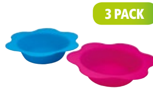
008041-S3 Taza Flor/ Flower Bowl

Contenido/Content: 700 mL / 24 Onz Master Pack: 192 CBM: 0.1103 Peso/Weight: 12.50 kg Dimensiones/ Size: 29 x 5,5 cm ø 16 cm Colores/Colours: ○ ● ● ● ● ● ● ● ●