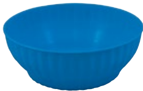
PT-0087 Ensaladera Salad Bowl

Master Pack: 180 CBM: 0.0471 Peso/Weight: 20.00 kg Dimensiones/ Size: 24.6 x 2 x 24.6 cm Colores/Colours: ○ ● ● ● ● ● ● ● ●