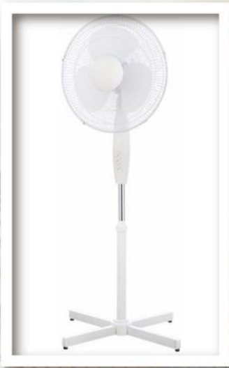
White Color 16 inch stand fan U/L