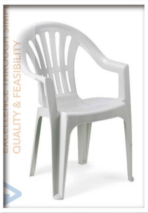
MID-BACK STACK CHAIR White, Beige , Dark Chocolate