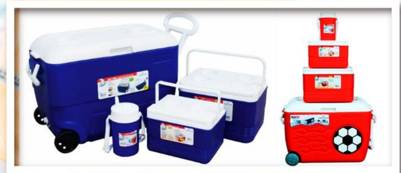
Chill Wheel Combo Set of 4 Pcs 50L (with wheels) + 14L + 6L + 1.25L COLORS RED & BLUE