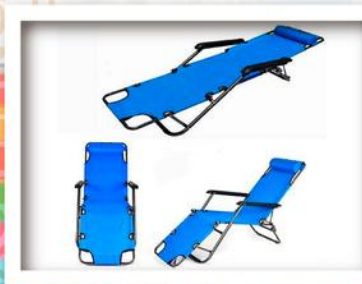
LOUNGER Size: 153*60*88cm; Chair Weight: 4.8kgs Steel: 25*0.8MM Max Weight: 120kgs Fabric: 600*300D oxford Powder Coated Steel Frame