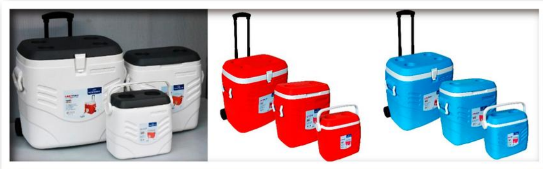
ICE BOX COMBO WHEELED SET OF 03 PCS 41 LITERS WITH TROLLEY , 20 LITER AND 8 LITER'