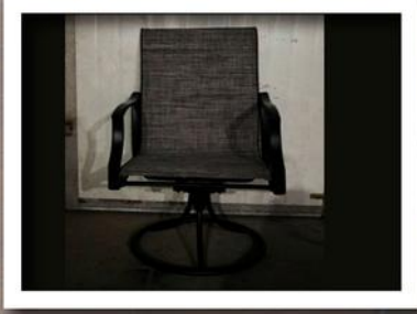
STEEL SWIVEL ROCKING SLING CHAIR CHAIR SIZE 26" X 30 " X 38.6 "