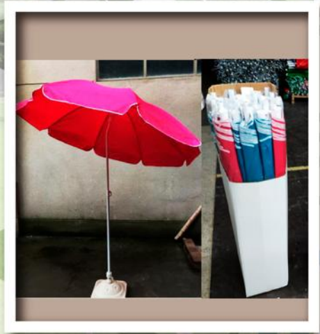
BEACH UMBRELLA DIA 2 METRE Steel tube: dia. 32mm, Steel ribs: 8pcs Fabric: 140g/m 2 polyester in solid color, with tilt COLOR OPTIONS RED, BLUE, PINK & ORANGE