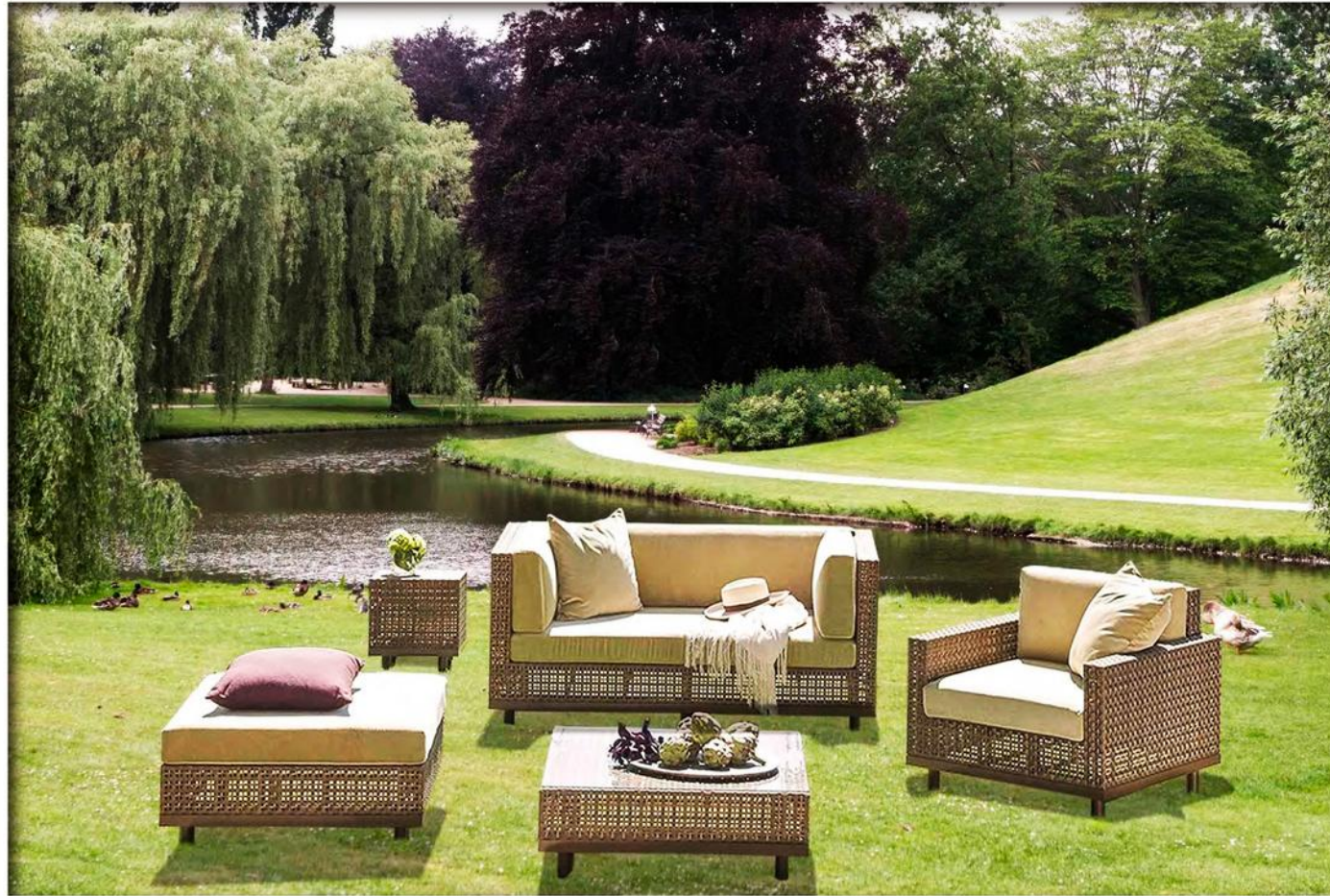
Wicker Set 1 piece 2 Seater , 2 Piece Single Seater & a Table Double Seater Sofa with Aluminium Frame 72.05 x 33.86 x 30.32 x Seat Height 16.53. Single Seater Sofa 33.85 x 33.85 x 30.32. Ottoman 33.85 x 33.85 x 45.28