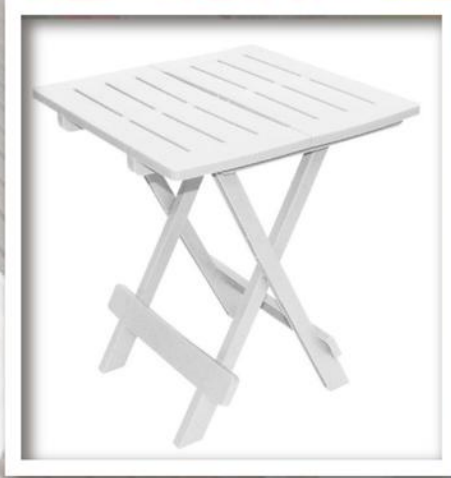
PLASTIC FOLDING TABLE 31.5" X 28.3" x 27.5" H 16.5 LBS