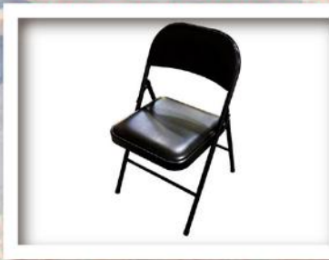
CHAIR STEEL WITH PAD FOLDING CHAIR 45 X 50 X 74 WEIGHT 19.2 KGS