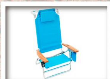
Sand Chair 1 x 1 Textilene 66 x 47 / 60 x 43 / 98