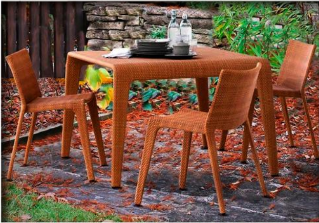
5 Piece Dining Set comprising of a KD Table and 4 Chairs Dining Table & Chair with Stainless Steel Frame powder Coated, Table 82.68 x 43.30 x 29.53