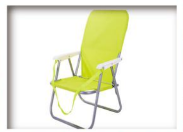
Sand Chair 1 x 1 Textilene 59 x 55 x 69