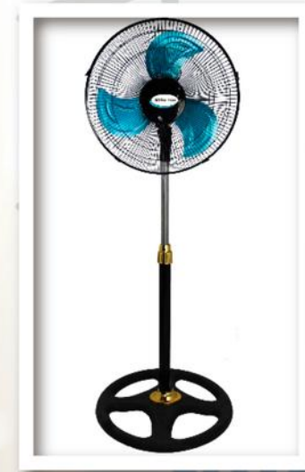
16 INCH Industrial Stand Fan with 3 Aluminum Blades With U/L