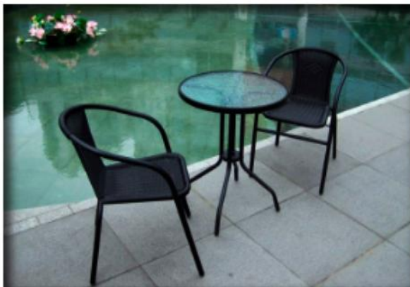
3 Piece Wicker Bistro Set STEEL RATTAN GLASS TABLE SET WITH 2 CHAIRS TABLE Size: Dia23.60 " x 27.6 " CHAIR 20.87 x 22.84 x 28.75 inches Tempered transparent water-grain glass (with umbrella hole);

NEXXGEN EXCELLENCE THROUGH SIMPLICITY, QUALITY & FEASIBILITY