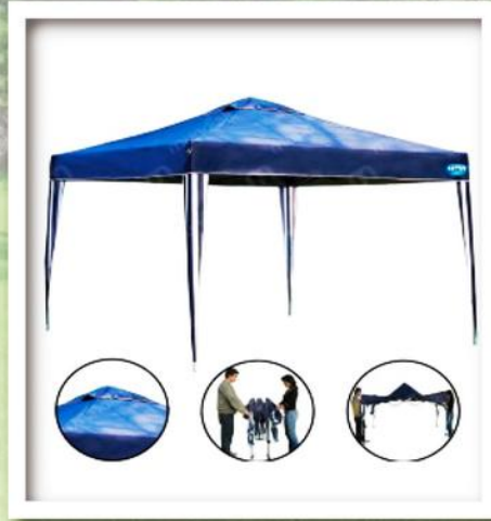
Folding Gazebo, top size:3*3m, Top size:2.95*2.95m, tube:(foot)25*25/20*20mm, steel tube with powder coated. Fabric: 160 polyester, Packing: 1 set in a 300D polyester carrybag COLOR OPTIONS WHITE & BLUE