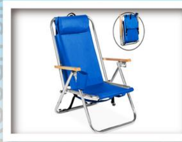
Sand Chair 1 x 1 Textilene 52 x 62 x 82