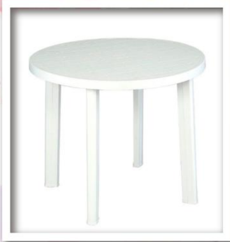
PLASTIC ROUND TABLE 5" DIAMETER X 28.5" HEIGHT 13.8 LBS