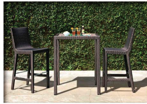
3 Piece Wicker Bar Set KD Bar Stool with Aluminium Frame Powder Coated 19.68 x 21.66 x 45.28 Seat Height 29.52. Bar Table 32.29 x 32.29 x 45.28

NEXXGEN EXCELLENCE THROUGH SIMPLICITY, QUALITY & FEASIBILITY