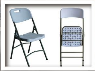
BLOW MOULDED CHAIR BLOW MOUNDING FOLDING CHAIR 51 X 45 X 85.56 WEIGHT 25.2