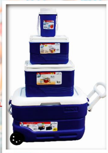
Chill Wheel Combo Set of 4 Pcs 40L (with wheels) + 14L + 6L + 1.25L