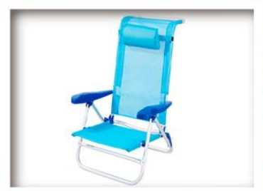
Sand Chair 1 x 1 Textilene 85 x 46 / 60 x 21 / 73