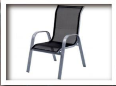
Stacking Chair Steel steel tu size: 54*74*93cm steel tube :42*14, 27*15mm fabric :1*1 textilene 26pcs/stack with pallet