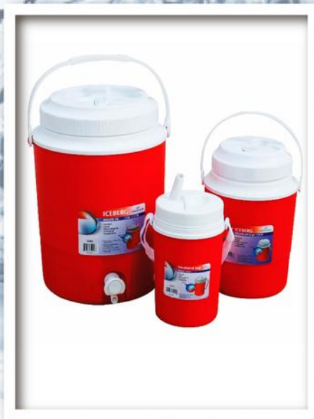
COMBO SET OF 3 PIECES 7.5L + 2.4L + 1.25L