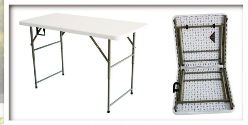
Fold in Half Table 4FT FOLDING TABLE, HEIGHT ADJUSTABLE HDPE TABLE TOP THICKNESS 3.5CM POWDER COATED STEEL TUBE DIA.25*1.0mm, 19*1.0mm