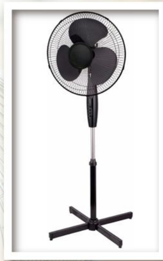
Black Color 16 inch stand fan U/L