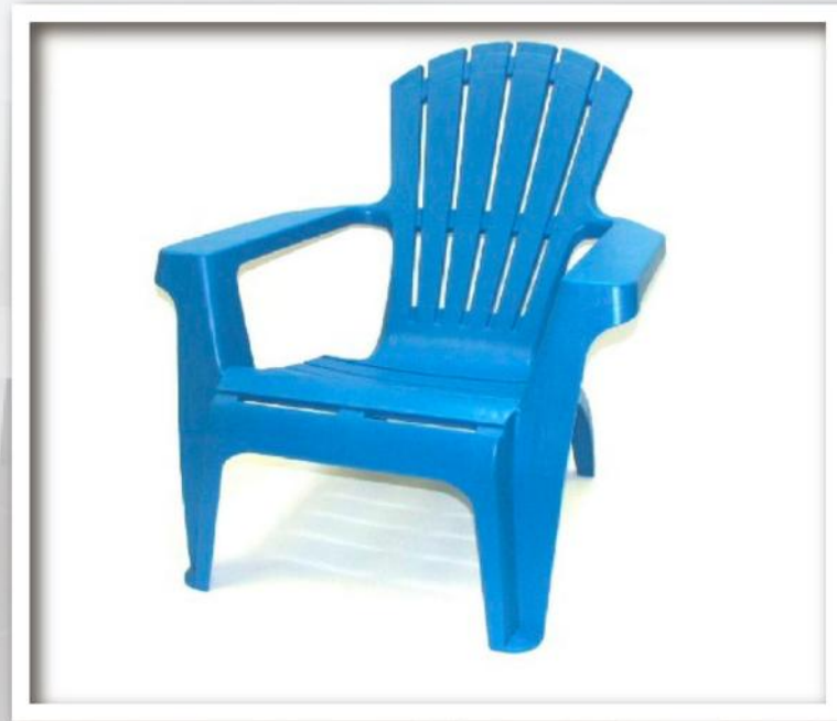
DOLOMITI ADIRONDACK STACK CHAIR Pool Blue , Summer Green , White & Fuchsia 33" L x 29.5" W x 34"H 10 lbs