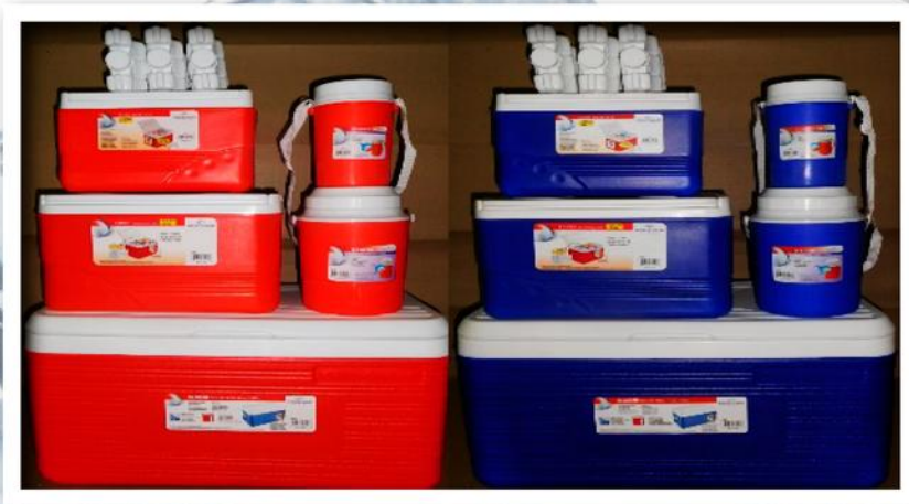
NEW GLACIER - ICE BOX 5 PCS SET 50L + 14L + 6L + 2.4L + 1.25L