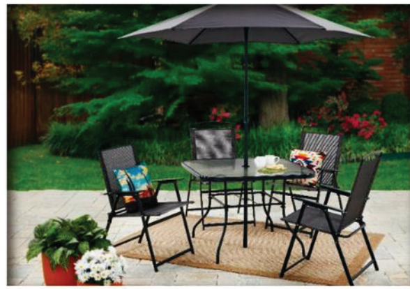
6 Piece Patio Set Comprising of 4 Chairs, 1 Square Table & an Umbrella 1 Water Wave Glass top folding table with pre-cut umbrella size 35.25" x 35.25" x 28" , 4 folding chairs 25" x 22" x 36" , powder-coated steel; textilene fabric, with patio umbrella built with a single wind vent, providing optimal durability and cool ventilation; Umbrella 7 Feet Diameter and 7 feet Height