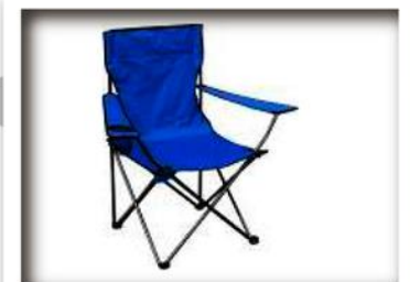
CAMPING CHAIR BLUE WITH A CARRYING BAG Size: 32 5/8" X 20" X 32" INCHES Fabric : 600D polyester with PE coating Tube : 16mm steel tube with Powder Coating