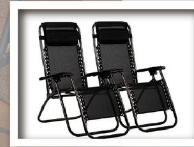
ZERO GRAVITY CHAIR 70 " X 26 " X 41.75 " Material: textilene 2 x 1, Tube 25 mm with Powder Coating