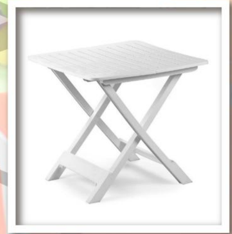
PLASTIC FOLDING TABLE 17.5" X 17" x 19.5" H 4.6 LBS