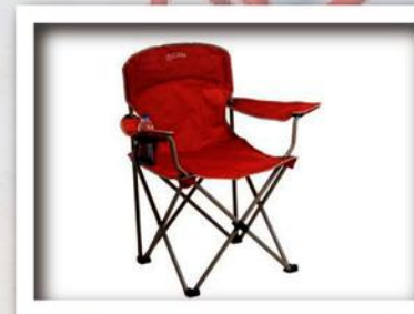
OVERSIZED CAMPING CHAIR RED Size: 37 2/3" X 23" X 36" INCHES Fabric : 600D polyester with PE coating Tube : 16mm steel tube with Powder Coating

EXCELLENCE THROUGH SIMPLICITY, QUALITY & FEASIBILITY