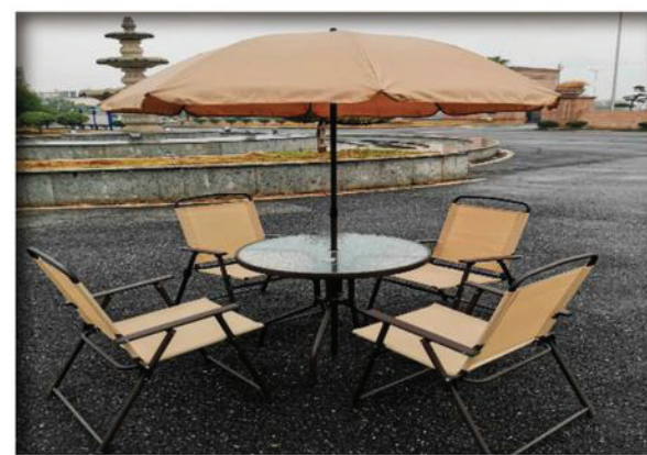
6 Piece Patio Set Comprising of 4 Chairs, 1 Round Table & an Umbrella 4 Chairs with textilene fabric of 25" x 22" x 36" " 1 Table with water wave tempered glass 31.5" Diameter x 28" a 6 Feet Diameter Umbrella with 6 Feet Height