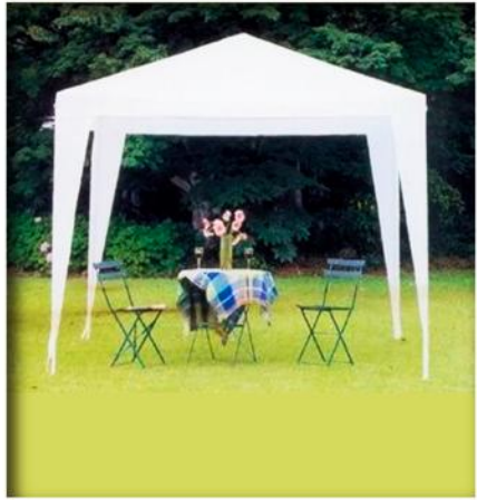
10'X10' PE steel tube gazebo, steel tube: dia. 18x18x18mm, 100g/m 2 PE cover COLOR OPTIONS WHITE, GREEN, BLUE & RED