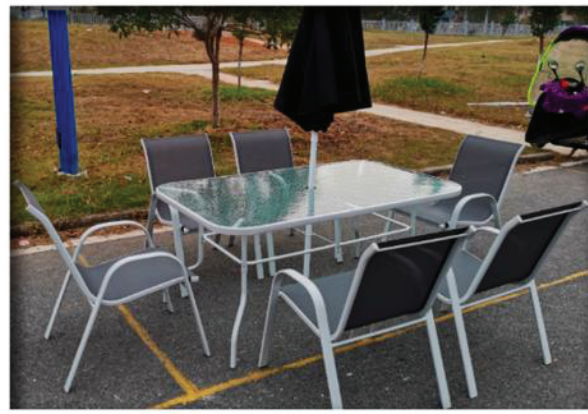
8 PIECE SET OF 1 TABLE , 6 CHAIRS & AN UMBRELLA TABLE 60 " X 35.5 " X 27.56 " WITH 5 MM TEMPERED GLASS WITH WATERWAVE, UMBRELLA SIZE 6 FEET X 6.5 FEET HEIGHT , CHAIR 21.26 " X 27.56 " X 35.43 "