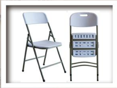
BLOW MOULDED CHAIR FOLDING CHAIR 45 X 44 X 86 WEIGHT 25.2 KGS