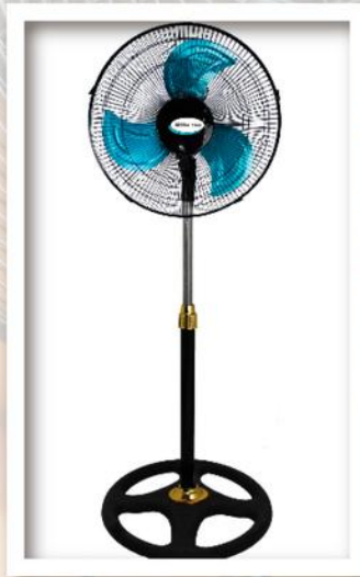
18 INCH Industrial Stand Fan with 3 Aluminum Blades With U/L