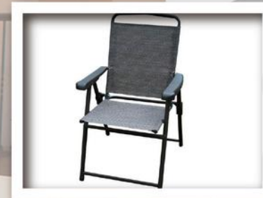
Foldable Chair 57 x 63 x 89 , Steel Tube 24 mm Dia Powder Coated. Plastic Arms & 2 x 1 Textline