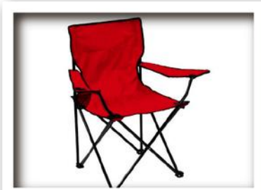
CAMPING CHAIR RED WITH A CARRYING BAG Size: 32 5/8" X 20" X 32" INCHES Fabric : 600D polyester with PE coating Tube : 16mm steel tube with Powder Coating