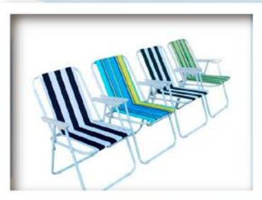
Long Beach Chair 1 x 1 Textilene