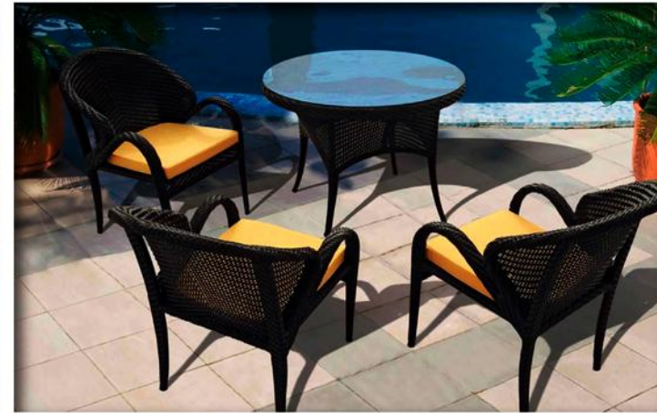
Wicker Set 1 Table & 2 Chairs Chair Depth 29.92 x Width 24.02 x Height 33.86 , Table Diameter 39.38 x 29.52