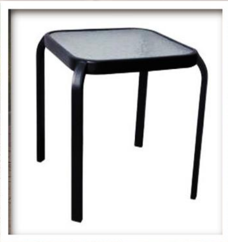
SIDE TABLE 15.75" x 15.75" x 16" Iron pipe: black plastic spray; Tempered transparent water-grain glass