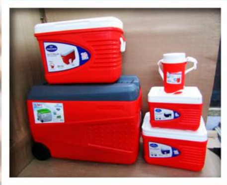
Husky Wheeled Cooler Set of 5 pcs 80L (with wheels) + 30L + 14L + 6L + 1.25L