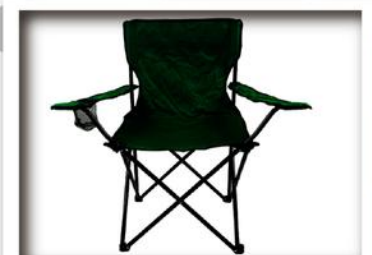
CAMPING CHAIR GREEN WITH A CARRYING BAG Size: 32 5/8" X 20" X 32" INCHES Fabric : 600D polyester with PE coating Tube : 16mm steel tube with Powder Coating