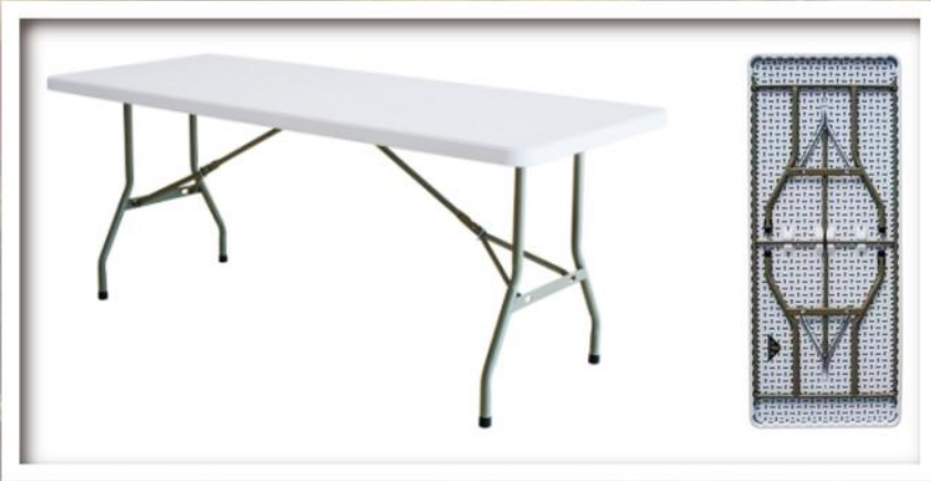
SOLID TABLE 6FT FOLDING TABLE HDPE TABLE TOP THICKNESS 4.3CM POWDER COATED STEEL TUBE DIA.28*1.0mm