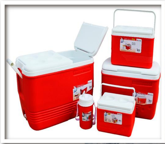
GLACIER SET OF 5 PCS 60L + 30L + 14L + 4.5L + 1.25L